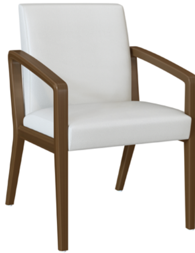
Model: MDAG11 24W 27D 35H 20SW 18.5SD 19SH 26AH

Kwalu's Modena Flex Back chair provides slight movement in the back from the flex frame that connects from the seat of the chair to the back. The seat, arms and legs remain stationary to deliver ergonomic support as the user changes position during waiting periods. The unique tapered arms are made of Kwalu's proprietary material. The design of the arm design has a faceted edge. The chair also features modern wallsaver back legs to keep your walls in pristine condition.